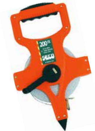
Seco 200' Reel Tape