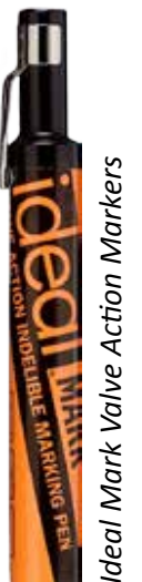
Ideal Mark Valve Action Markers