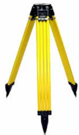
Dutch Hill Composite Tripod