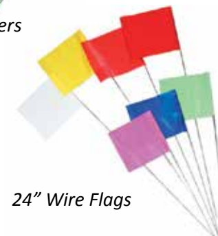
24" Wire Flags