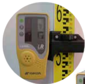
LS-80A w/ Holder 6