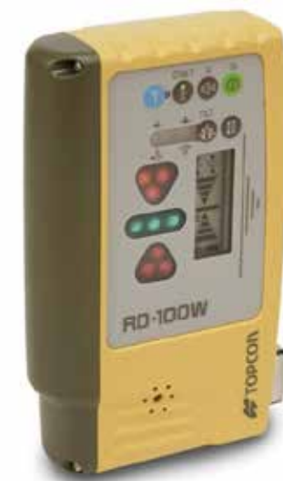
RD-100W Remote Display