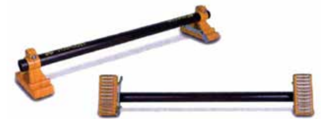
Topcon MAG Mount for Receivers