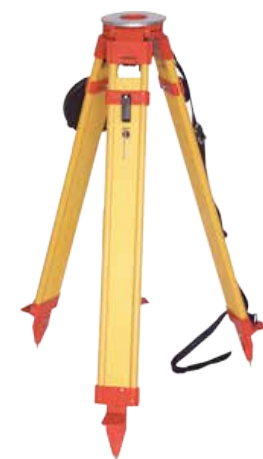
Nedo Svyr's Wood Q/L Tripod