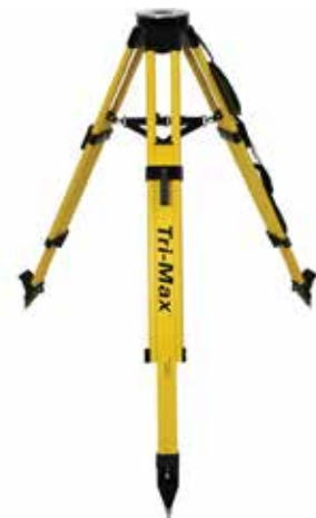
Tri-MAX HD FG Tripod