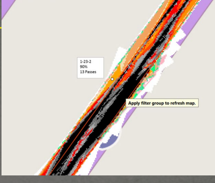
Composite (four rollers) as-built roll pattern. More passes = darker color, less passes = lighter color. The white dot is the location of a nuclear density test with a 90% value. KRC used the IC data + Sitelink3D to improve consistency of roll patterns.

systems to make necessary adjustments to the compaction process.