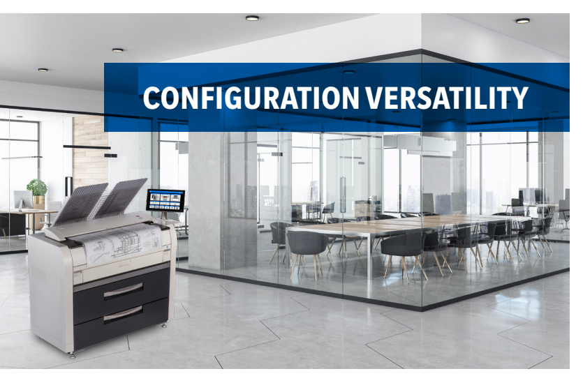
Space Saving Performance